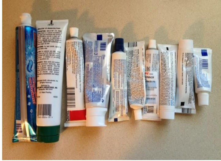
Figure 2: Which tube contains toothpaste and which is the haemorrhoid cream?

Following government requirements<sup>2</sup> is not always the answer. While satisfying the legal requirements, you still may neglect the authentic human experience. In the example shown in Figure 3, a legally blind man reads a Braille sign that can only be accessed by climbing on a piece of furniture (only 10% of individuals who are blind in the USA read Braille).