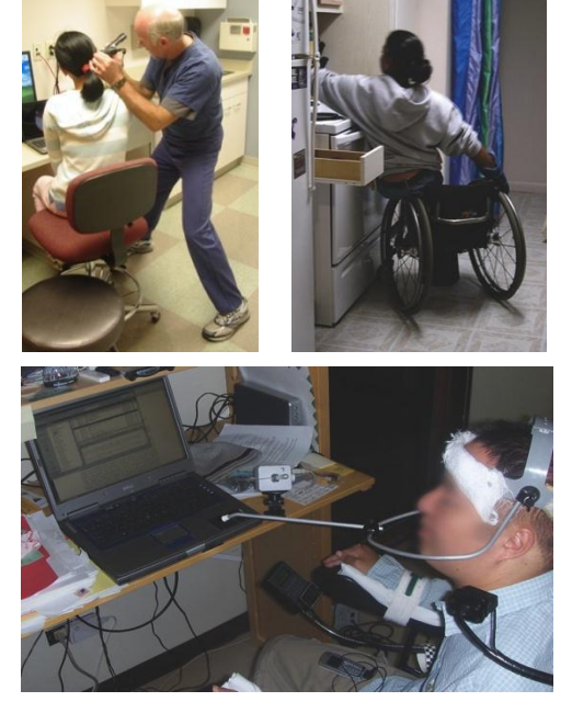
Figure 7a,b,c: Ethnographic recordings of expert-users.

In Figure 7a, a doctor uses an otoscope. His physical stance demonstrates an area of opportunity in the development of a new high-tech product. The user-experts in Figures 7b&c have physical disabilities that require them to approach mundane tasks in unexpected ways.