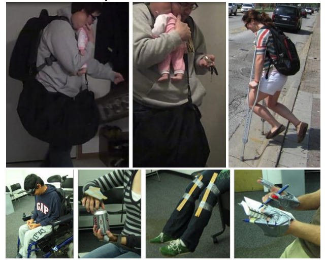
Figure 9: Modelling the experience of another – caring for an infant for a week, using assistive devices, limiting range of motion and dexterity.