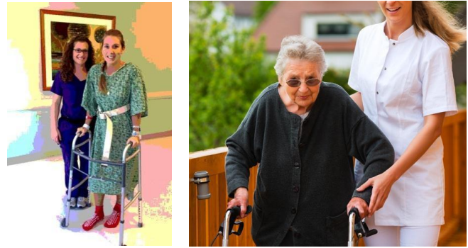
Figure 6 a & b: Products that evoke a perception of stigma may be abandoned.

In Figure 6a, a young woman uses a Zimmer frame (walker) after surgery. If she feels stigmatised by her own internal image of a person using this product (6b) and she abandons its use, the results of her surgery and healing could be significantly reduced.