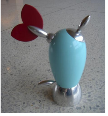
Figure 4: Extreme emotional connection: Functionality was not the main focus

A conversation with users about products in their possession that they 'love' or 'hate' reveals that emotional connections to products can be related as much to the giver of the product as the product itself. In Figure 5, a group of young adults discuss their emotional connections to products they own. Exploring both the utilitarian and supra-functional/emotional (e.g. users' style, lifestyle, aspirations)<sup>3</sup> provide cues to ensure better design outcomes.