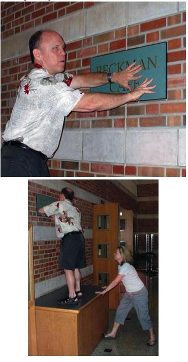
Figure 3: Extreme functional failure: Braille signage meets regulatory requirements but not user needs

Products can also evoke strong emotional responses in humans that can lead to purchase desire, retention of old and or/unused products, or even product abandonment. In Figure 4, the shape and colour of the pepper grinder called to one of the designer/authors from across the shop first bringing the compelling reaction "I must have that", followed by the question "what is it?"