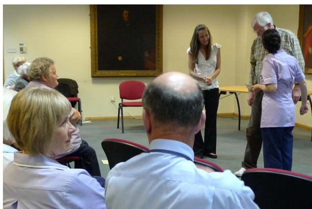
Figure 3. Photograph from the event

Interactions between patients, carers and staff were critical touchpoints in the experience of using outpatient services. The hospitals provided 'customer care' training in the form of an e-learning educational package, but it was evident from our in-depth inquiry of experience that this was a very limited approach to addressing negative emotional factors and promoting positive attitudes and behaviours. We therefore commissioned a local theatre group ( Dead Earnest ) to produce an interactive learning event based on the techniques of applied theatre. 15